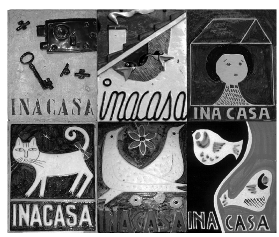
O6 Ceramic tiles that distinguish one of the INA Casa District.

given its status as a pilot intervention. Here, Ridolfi designed both in-line terraced houses, adapting them to the rigid structural scheme of load-bearing masonry, and tower blocks, where, instead of capitalizing on the freedom offered by the concrete framework, he forced the framing into the role of a sort of reinforcement of the walls, adapting the position and section of the concrete pillars to the masonry planes. Mario De Renzi was among the first to propose the tower block, in an original star-shaped version achieving greater facade surfaces and multiplying the views, in the Valco San Paolo district of Rome (1949-1952)10. Adalberto Libera's design for the Tuscolano III project (1950-1954) remains unique: a horizontal dwelling unit, closely descended from Mediterranean tradition, counterpointed by high buildings with external access galleries. Derogating from the INA-Casa instructions on density, Adalberto Libera designed an urban quadrangle incised by narrow pedestrian lanes and perforated by terraces, overlooked by single-story homes gathered in groups of four. Above these rise higher buildings, with minimal housing units inserted in a field of portals in reinforced concrete, endowing the facades with rhythm.