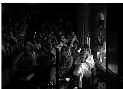
06 Morning keynote lectures, auditorium 2.

Just to say a huge thank you for the conference in Lisbon. I know everyone from Australia really enjoyed it too. It was really terrific, and I especially valued some of the keynote contemporary practitioners, who were so refreshing in their work with adaptive reuse. They will make great exemplars in my teaching.