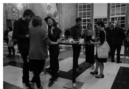
09 Closing party, Alcântara maritime station. © docomomo International, Leandro Arez, 2016.