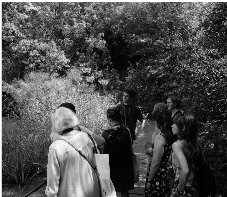
08 Tour to Calouste Gulbenkian Foundation.

It was my first participation in the Docomomo conference and to me it was an honour and pleasure to be at this event. (...) I could learn a lot from all the morning and afternoon lectures (the choice of lecturers and topics was absolutely fantastic) as well as from the presentations at the panel sessions. (...) Last but not the least - the venue of the conference i.e. the Gulbenkian Foundation is great and your tour gave a chance to see more of that!