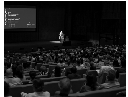
15 Main auditorium. © docomomo International, Márcia Lessa, 2016.